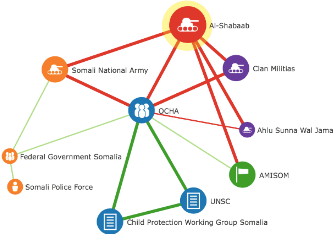
Figure: Relationship of OCHA with the respective stakeholders

The following figure illustrates the relationship that OCHA Somalia has with the respective stakeholders in eradicating child recruitment, as identified in the stakeholder analysis. Green lines signal cooperation, whereas red lines indicate threat. The thickness of the line illustrates the degree of cooperation or threat.